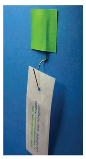
Figure 1. Examples of proper BI configurations when using the hole in the envelope to hang the BI

Plastic spacers have been placed on the wire hanger between each BI to ensure proper vapor flow around each BI unit.