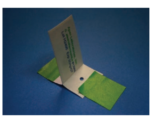
Figure 2. Examples of proper BI configurations when using adhesive tape to position the BI