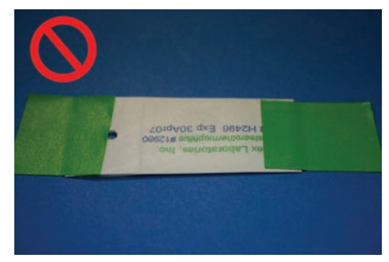
Figure 3. Examples of IMPROPER BI configurations when using adhesive tape

Another common practice, especially when using a large number BIs, is to write identifying marks on each BI. These marks help identify the location in which the BI was placed as demonstrated in the first photograph in figure 4. As is the case with the tape, placing marks on the pocket of the envelope should be avoided. Certain types of ink may also catalyze hydrogen peroxide and should be avoided completely.