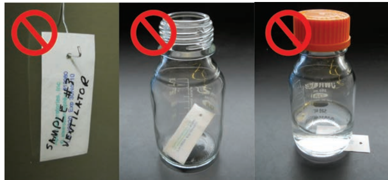
Figure 4. Examples of IMPROPER BI use: writing on the face of the package, and placing BI into or underneath a container.

Due to poor vapor flow, placing Bls into or underneath bottles (figure 4) or other containers is not recommended.