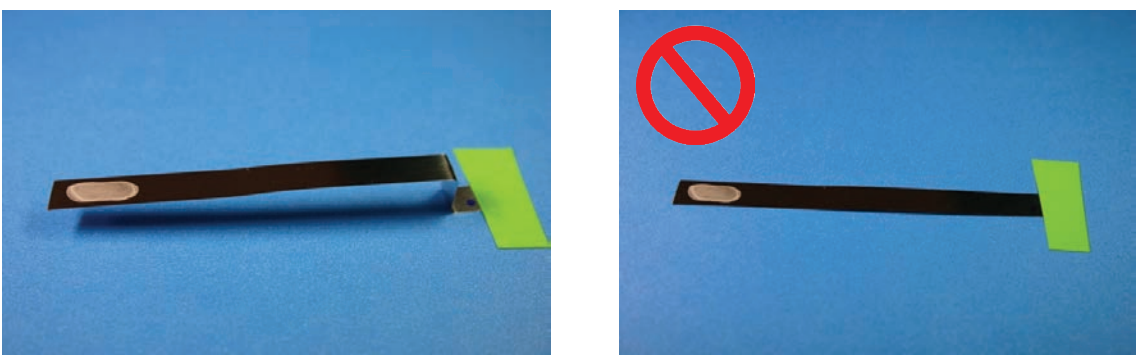
Figure 5. Examples of proper (left photograph) and improper (right photograph) BI configurations

The ribbon BI can also be positioned by hanging or taping in place. The inoculated area should always be positioned so that it faces outward and ideally so that the vapor can flow by both sides of the ribbon as demonstrated in figure 5.