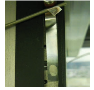
Figure 6. Examples of ribbon BIs in dead leg (left photograph) and hanging on isolator fixture (right photograph)